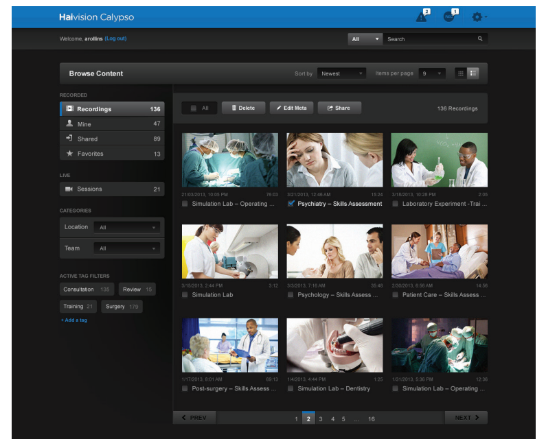
Calypso Content Browser